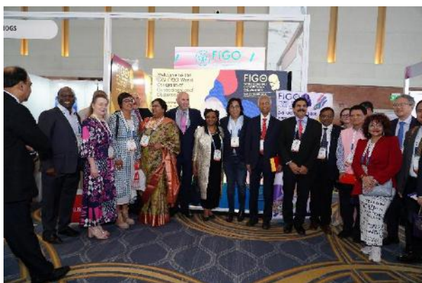
AICIG 2025 at the FIGO stall

I wish to conclude by requesting our member societies to keep us informed about activities which AOFOG could join. I also look forward to closer collaboration with the National Societies in 2025.