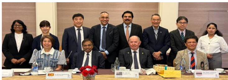
Exec Board meeting

I would like to highlight the recent AOFOG Executive Board Meeting and Action Plan Meeting (APM), held on February 8th, 2025, at the Hotel Anantara Siam in Bangkok, Thailand. It was encouraging to see 100% attendance at both meetings, which were very successful and productive. The committee chairs presented their completed work and future plans at the APM.