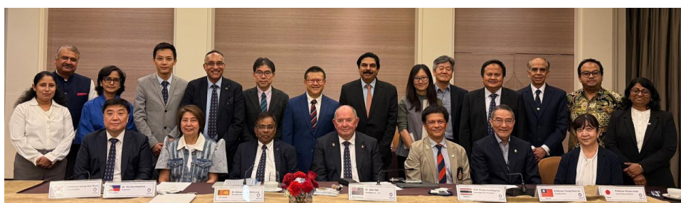
Action Plan Meeting